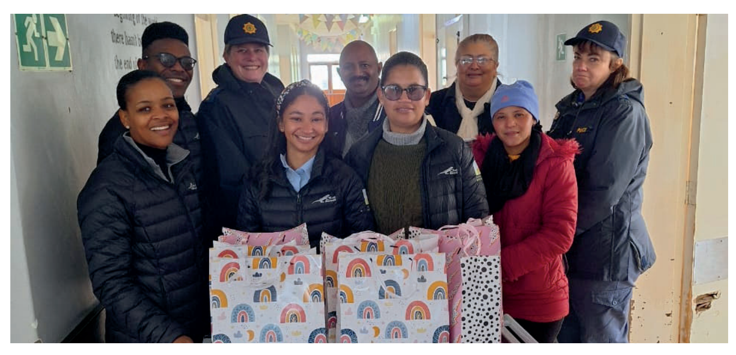
PHOTO: Pediatric mothers at Ceres Hospital treated to a special day.