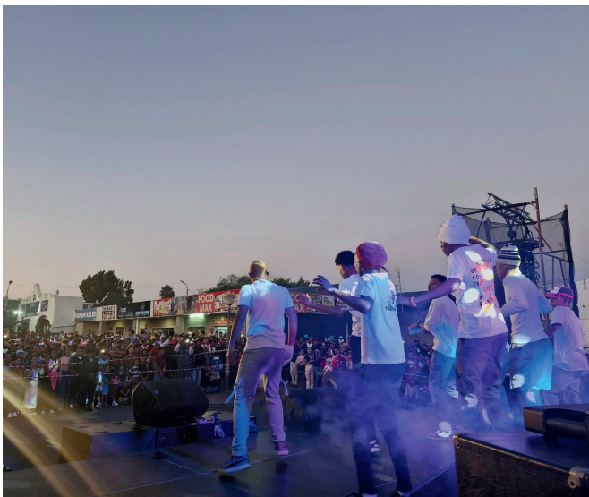
PHOTO: Local dance group, the Ultimates, performs at the Market.