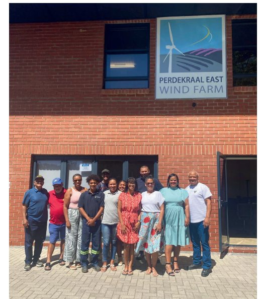
PHOTO: Local entrepreneurs empowered through business training.

We also trained six small businesses on the basics of bookkeeping, financial management, and HR principles, giving entrepreneurs the tools they need to thrive.