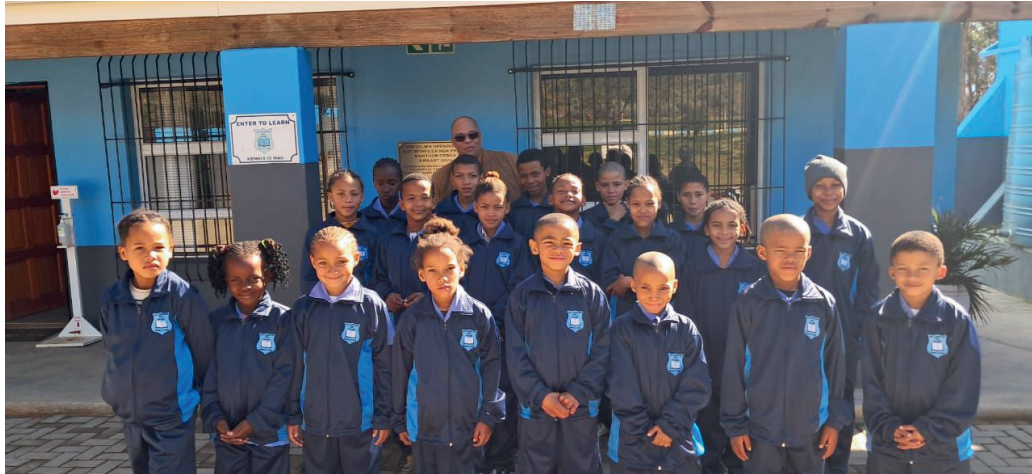
PHOTO: Close to 400 local school learners benefit from a winter uniform drive.