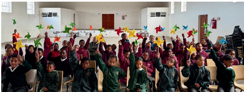
PHOTO: Local primary school learners celebrating Global Wind Day.

The day ended with a fun quiz, prizes, goody bags, and lunch.